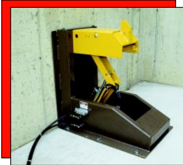
(in Front of Dock)

The Model TL-100-F is designed for installation directly in front of the loading dock. This electric/hydraulic system lifts a carriage to capture the ICC bar on the back of semi-trailers. To ensure maximum safety the unit comes standard with an accumulator that allows the lock to follow the trailer up and down as it is loaded/unloaded. A beeper and flashing light warns the operator if the lock does not engage the trailer properly. A visual indication of the restraints status is shown at all times by the traffic light outside and the control panel inside. The TL-100-F comes standard with model DTS-10 light fixture and control panel.