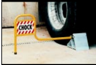
7.25"W x 8"H x 10.5"D