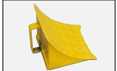
8"W x 7.5"H x 7.5"D