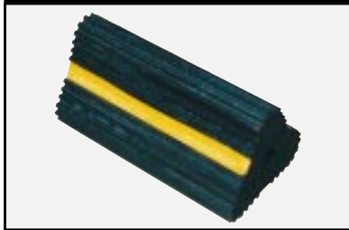
6"W x 6"H x 12"D