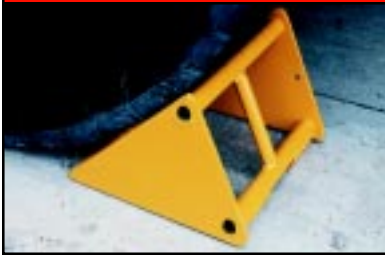
10.5"W x 10"H x 7.5"D