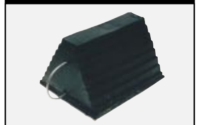
9"W x 5.75"H x 8"D