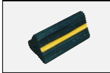
5"W x 5"H x 10"D