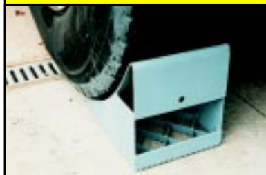
10"W x 8"H x 9"D