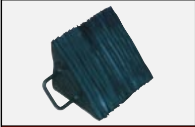
11"W x 8"H x 8"D