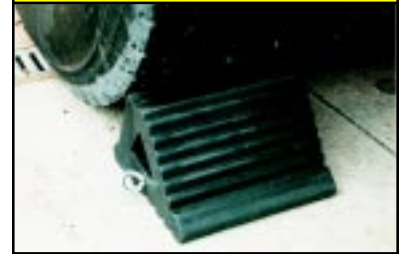
9"W x 6"H x 9"D