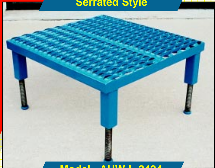
Model - AHW-L-2424

These Work-Mates are built lightweight and affordable. To adjust the legs to the desired height simply screw the legs in and out and the platform is ready to work. Serrated platform provides positive traction for wet environments. Units painted Royal Blue. Larger size platforms may require more screws for support.