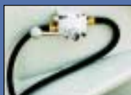
Easy Lever Control