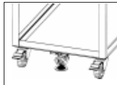
Model - FL-LK-5X