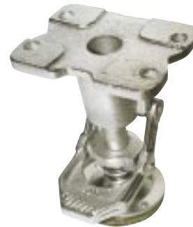
Aluminum Enamel Finish