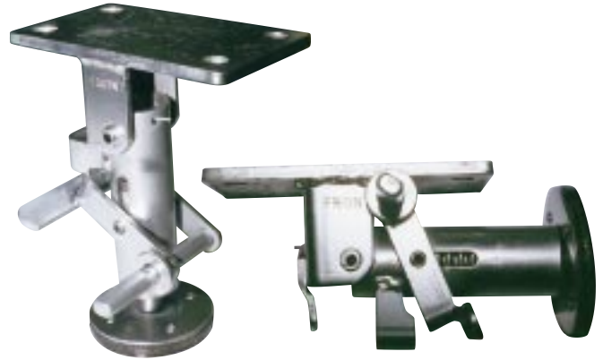
Aluminum Enamel Finish