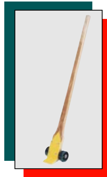
Model Number PLB-34