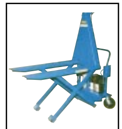
HIGH RISE LIFT TRUCK

Worker Friendly Products Profit Friendly Products