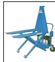
HIGH RISE LIFT TRUCK

Worker Friendly Products Profit Friendly Products