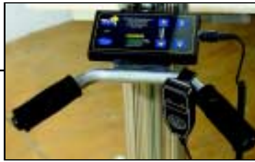
Simple Touchpad Allows for Lift Speed Adjustment, Battery Indicator Display and Up/Down Controls. Optional Hand Pendant with Coil Cord Pictured.