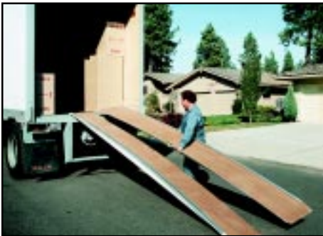
Ramp easily separates into two halves.