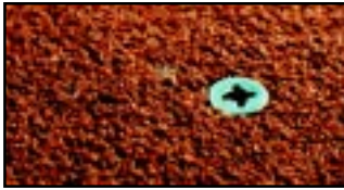
Abrasive surface provides incredible traction wet or dry.